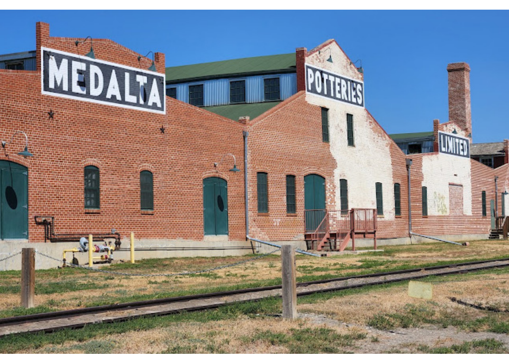
Conference Program Page 7

Both the Companion Program and the Youth Program will utilize other areas of Medalta, too, so be sure to reference the appropriate schedules in this program to ensure you know the locations of all your planned events throughout the weekend.