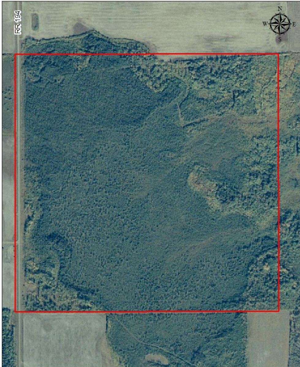
Sundew Conservation Property (SW 9-077-19-W5M)